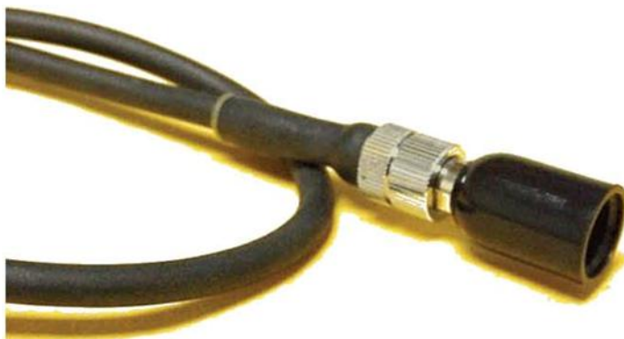
TT-MINI-PROBE connected to a TT-MLC-MC leader cable